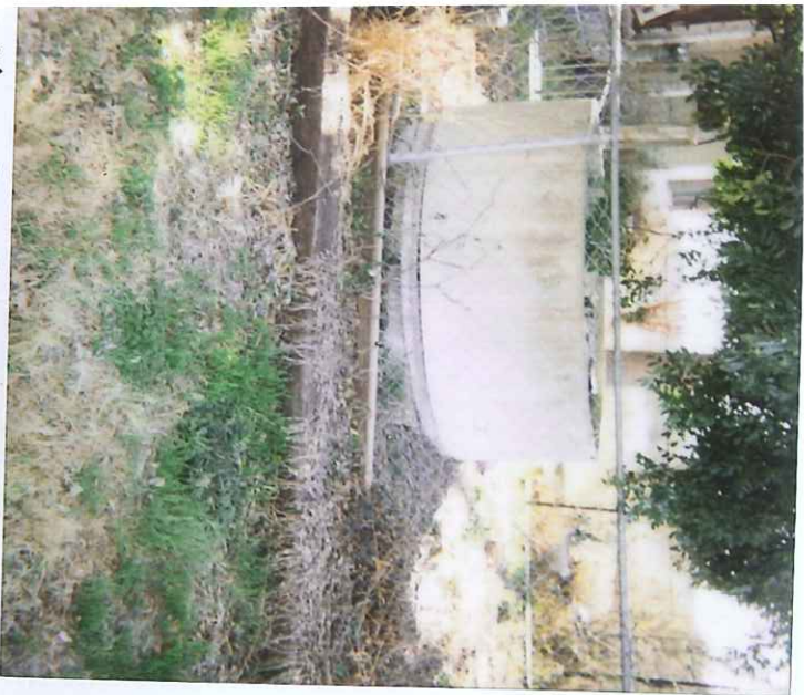
HAND DOG WELL THAT IS ROCK LINED