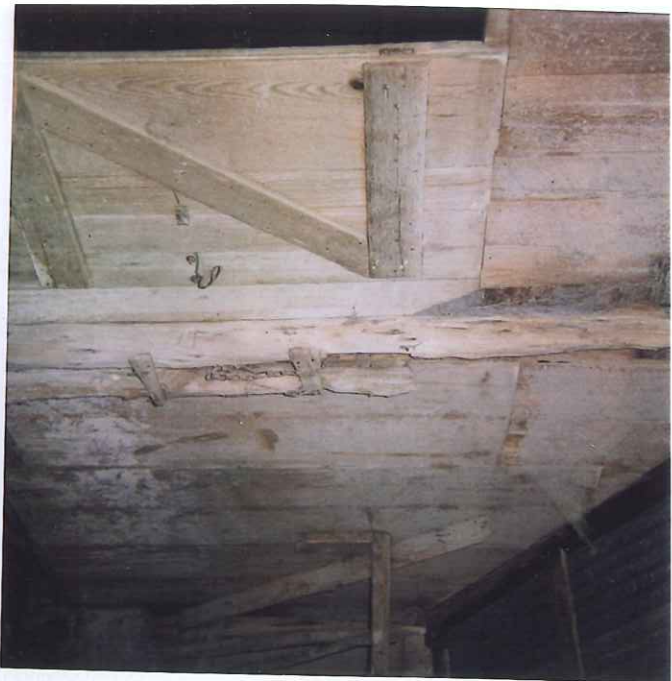
OTHER ROOM IN CATTLE BAR THIS OUT SIDE WALL AND DOOR