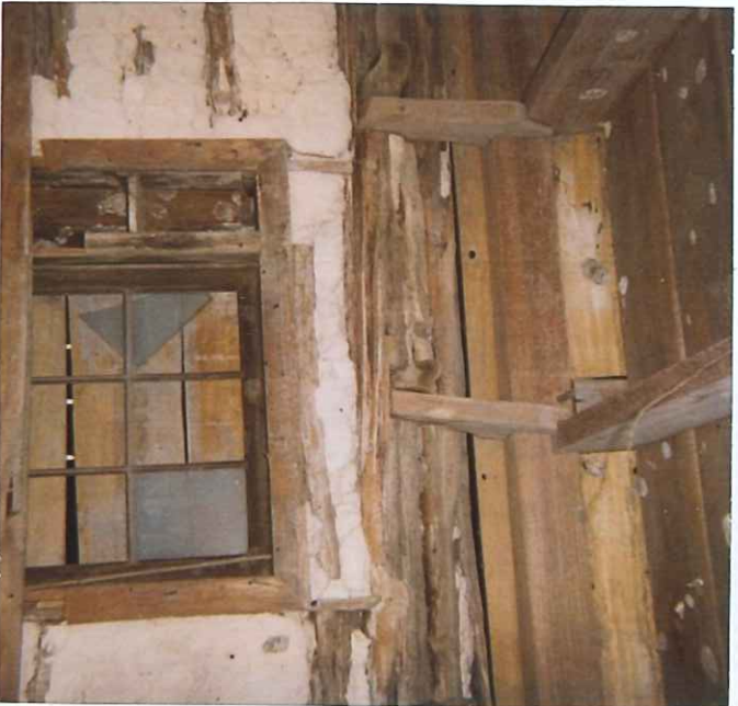
INSIDE OF CABIN