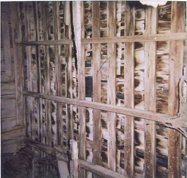
ROOF IN CATTLE BARN WHERE MULES WERE KEEP FOR HIS FREISHT SERVICE