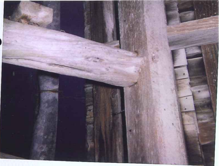
timber with Pegs IN little BARN