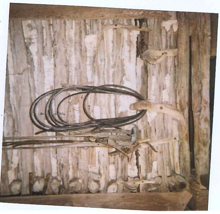
OUTSIDE OF CABIN HAND CARVED