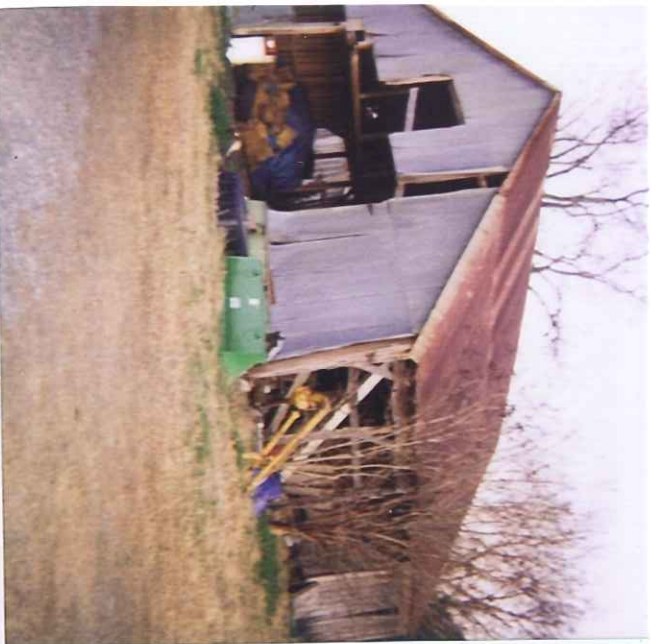
BUILT IN 1862 BY DFRITZ MEYER CABIN LOCATED IN BARN AND IS STILL BEING USED