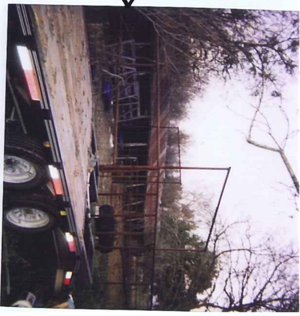
ONE END AND ANOTHER ROOM ON OPPOSITE END