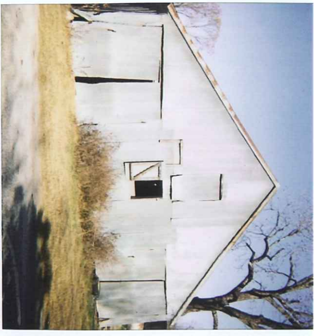
OPEN WINDOW IS WINDOW IN CABIN